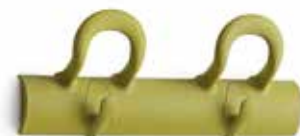
1519-VE rif. Pantone 3985U