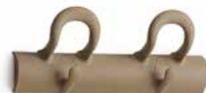
1519-BE rif. Ral 1019