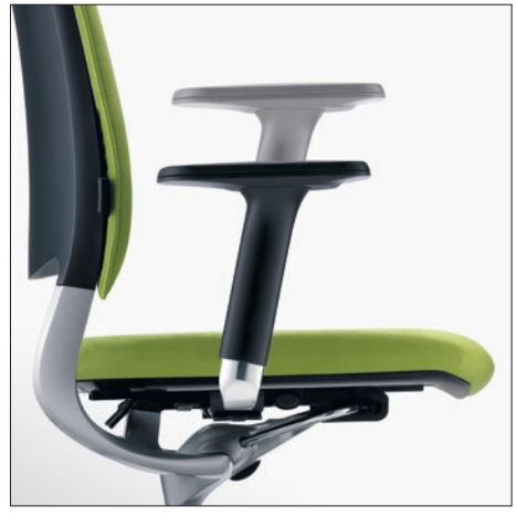
MULTIFUNCTIONAL ARMRESTS Height adjustable, tool-less adjustment of spacing, depth adjustable & rotatable.