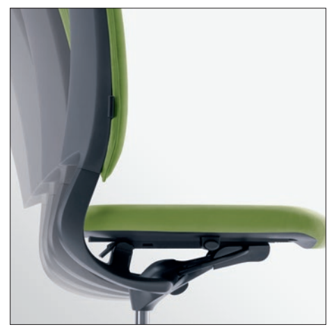
SYNCHRONE MECHANISM Seat and backrest move in a ratio of 1:3 to each other. Floating action. Lockable in four positions.