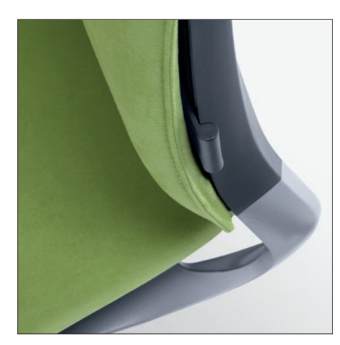
ILIAC SUPPORT Height adjustable.