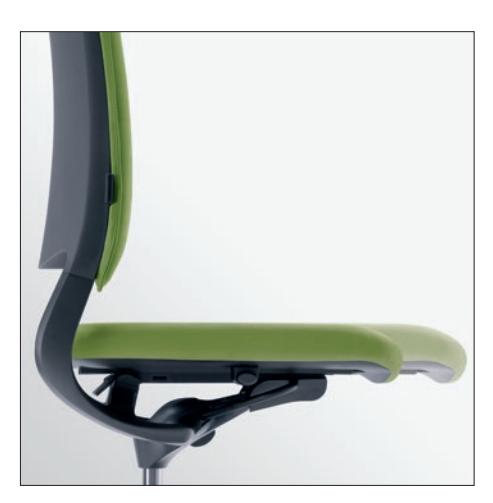
SEAT DEPTH ADJUSTMENT