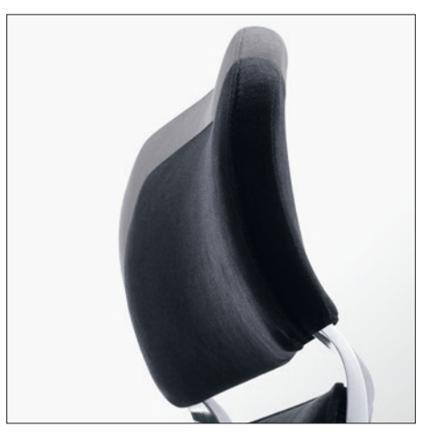
COMBINED NECK AND HEAD SUPPORT With simultaneous height and depth adjustment.