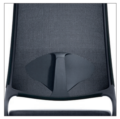
ILIAC SUPPORT - MESH Maintains ergonomic posture: the height-adjustable iliac support, integrated into the backrest, guarantees individual adaptation to the iliac crest (option).