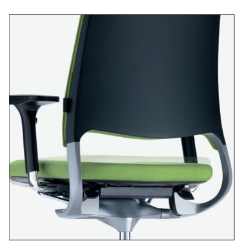
SEAT INCLINATION ADJUSTMENT