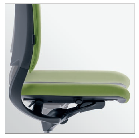
SEAT HEIGHT ADJUSTMENTS Option: Comfort column resilience.