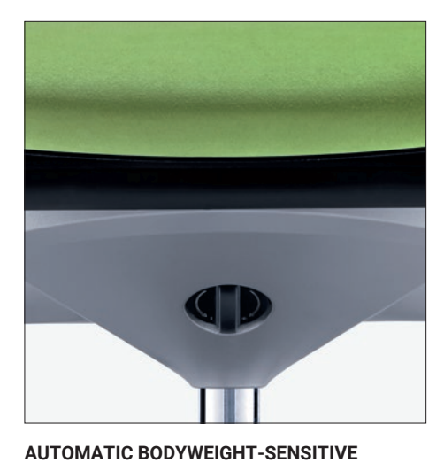
ADJUSTMENT With a manual, infinitely-variable regulation of the dynamics 50-110 kg.